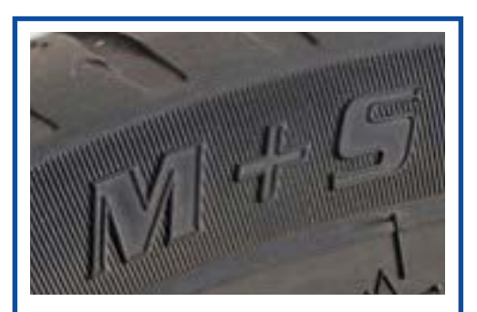
Mud and snow tyres are the minimum specification (with the M + S symbol pictured above)