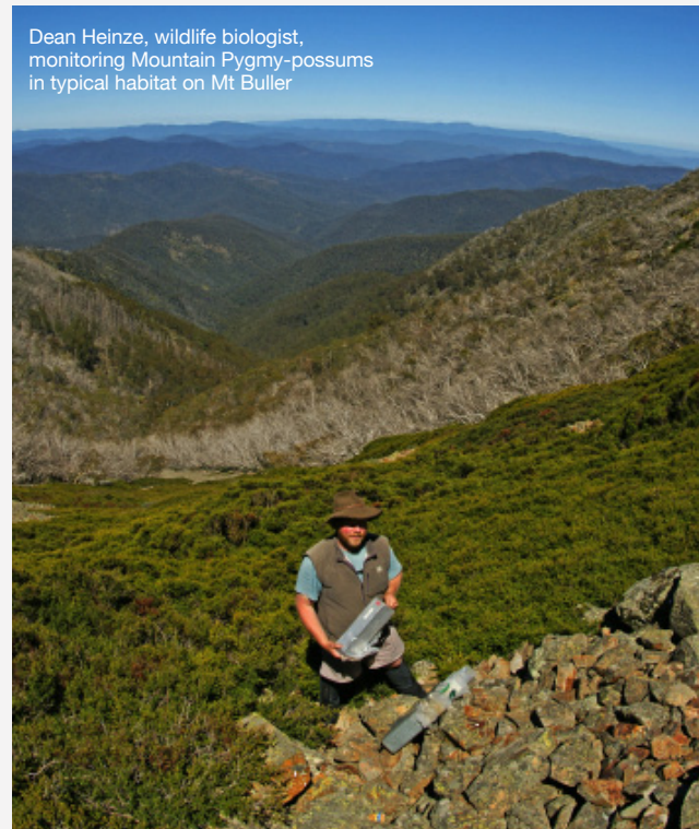
Dean Heinze, wildlife biologist, monitoring Mountain Pygmy-possums in typical habitat on Mt Buller

Of the five species of Pygmy-possum, the Mountain Pygmy-possum is the largest, weighing about 45 grams and measuring about 28cm, including a 16cm tail. It is also the longest-lived mammal of its size, often living to 12 years of age. Males and females are segregated, the females usually occupying high quality habitat at higher altitudes. Each spring, male Mountain Pygmy-possums move uphill into the breeding areas to mate with females. After the breeding period, males migrate back down to less productive environments, leaving the habitat with the most food and best shelter for the females and their young. Females give birth in November to a litter of four, which remain in the pouch until late December.